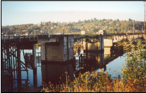
Isthmus Slough Bridge Pier Monitoring System Coos Bay, Oregon